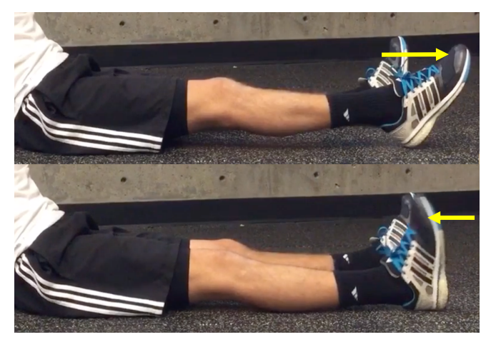
Calf-Pumps : Point toes and foot away, flexing calf muscle. Then raise toes towards you. Relax foot. 10-15 reps, 3 sets