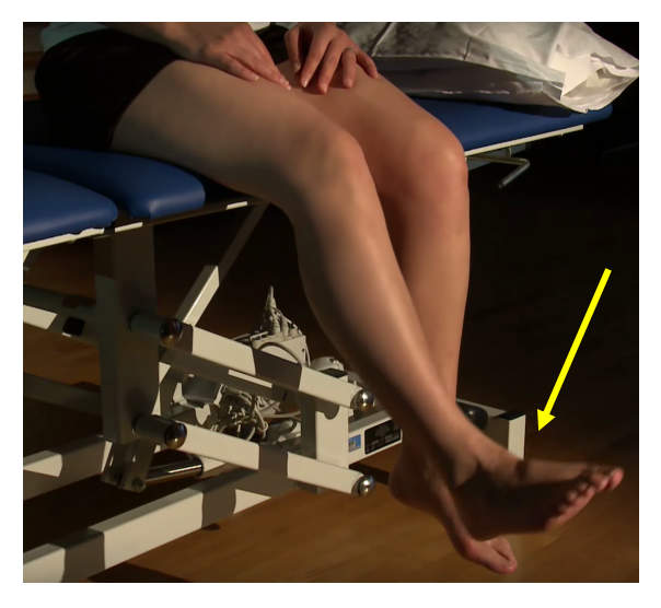
Leg Hang: Sit on elevated surface. Use nonoperative foot to support operative leg. Allow leg to bend with gravity to tolerance. Limit 0-90 degrees. Hold for 3-5 seconds. Repeat. 10-15 reps, 3 sets